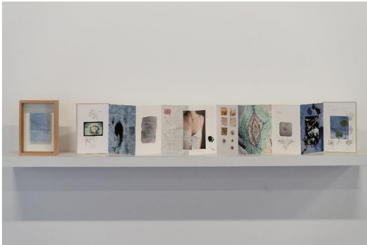
Caroline Tabet & Clémence Cottard Hachem, Secret-Soleils, 2021, Papaver Roheas, Wooden box, 25.5 cm * 17 cm * 6 cm © Dimitri Nassar, Courtesy of Galerie Tanit.

https://www.emergentmag.com/exhibitions/togetherness-at-galerie-tanit