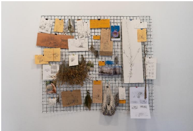
Christian Sleiman, A Seasonal Ritual, 2021, Mixed media installation, 150 cm * 180 cm