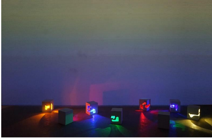
Elias Nafaa, Pulsations, 2021, Wood and glass, rechargeable batteries, 25 cm * 20 cm * 20 cm each (1)